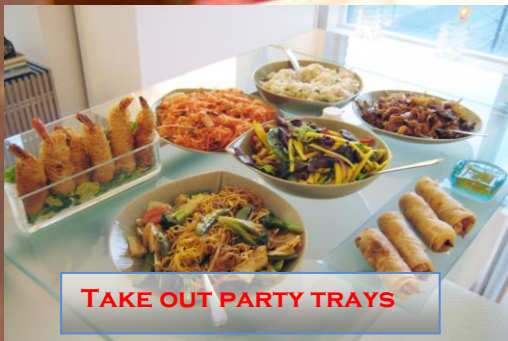
TAKE OUT PARTY TRAYS